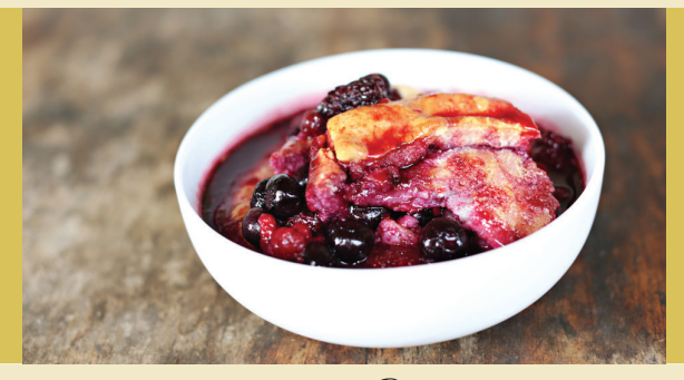
Types of Sonker

The crusts vary. Some recipes call for a pie-like crust, while others call for a bread-crumb topping. Sometimes sonker is made in a pot on the stove, with a crust that is more akin to dumplings.